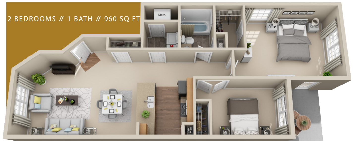
2 BEDROOMS // 1 BATH // 960 SQ FT