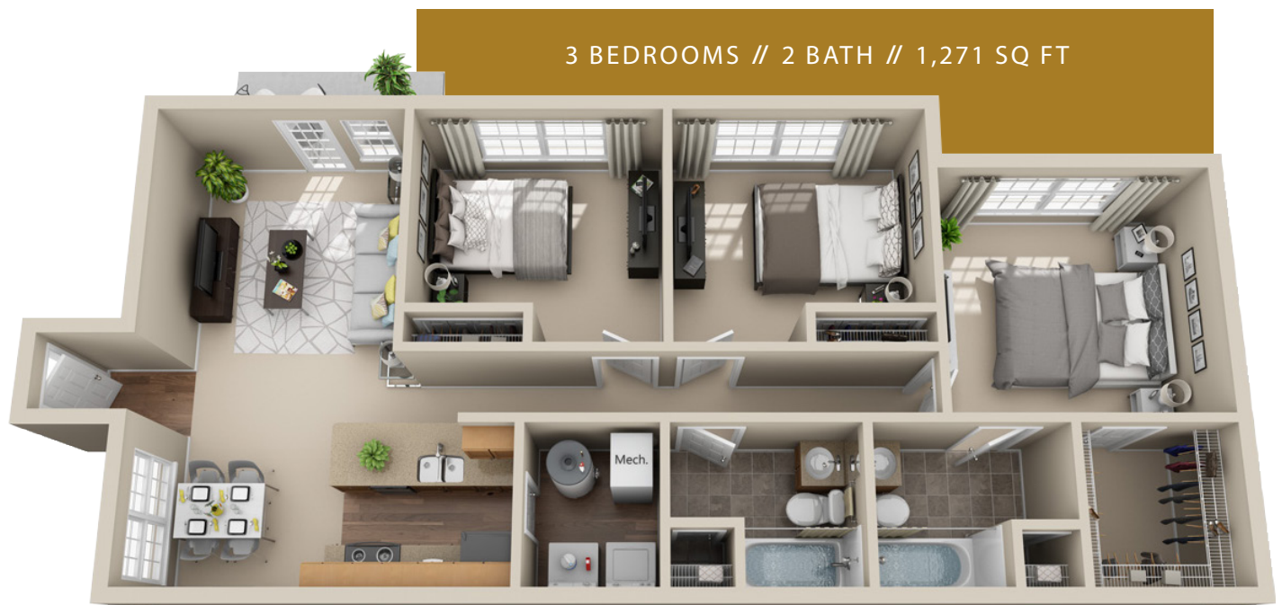
3 BEDROOMS // 2 BATH // 1,271 SQ FT