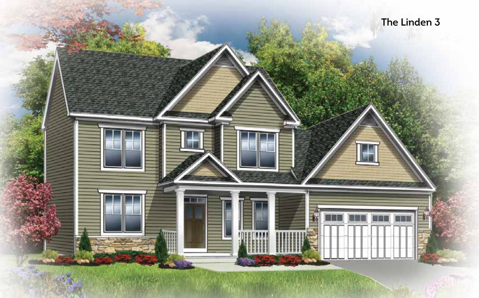
The Linden 3