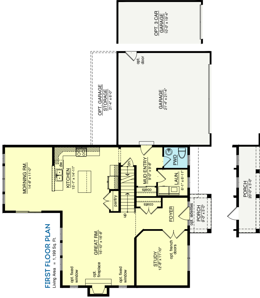
ELEVATION 3 PORCH