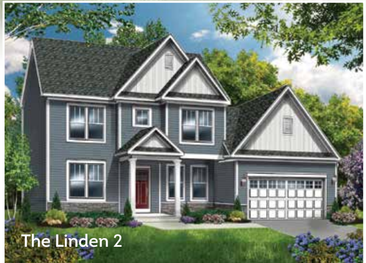
The Linden 2