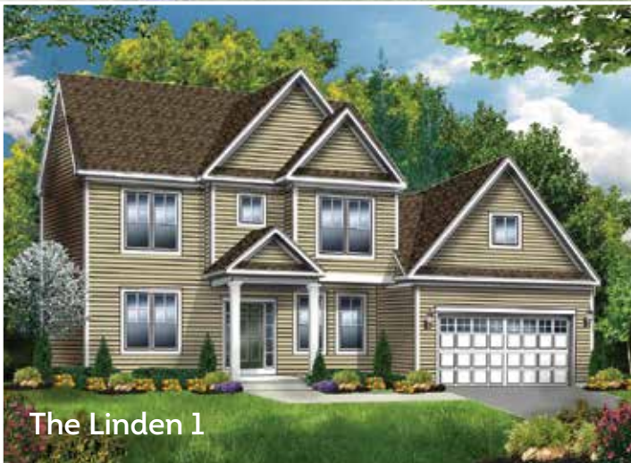
The Linden 1