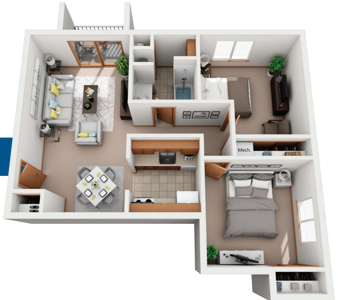
2 BEDROOM/1 BATH 700 SQ. FT.