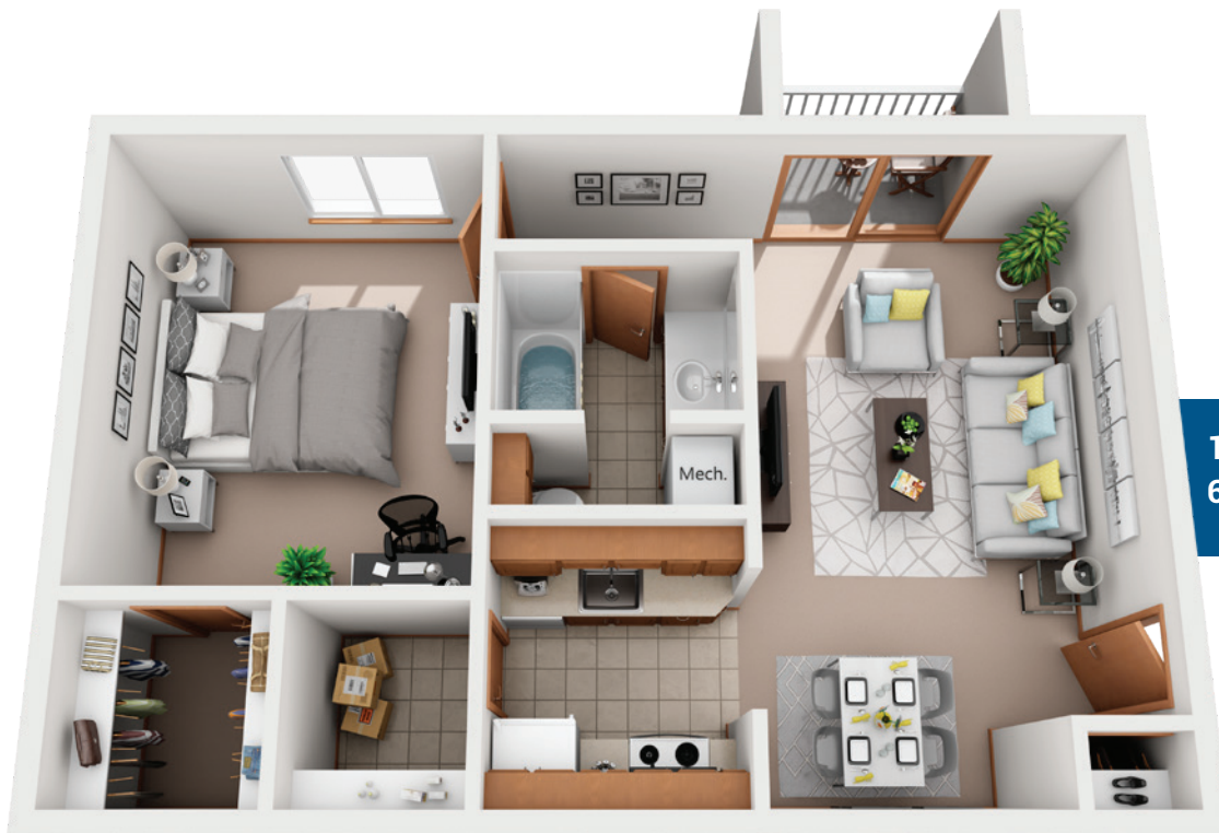
1 BEDROOM/1 BATH 640 SQ. FT.