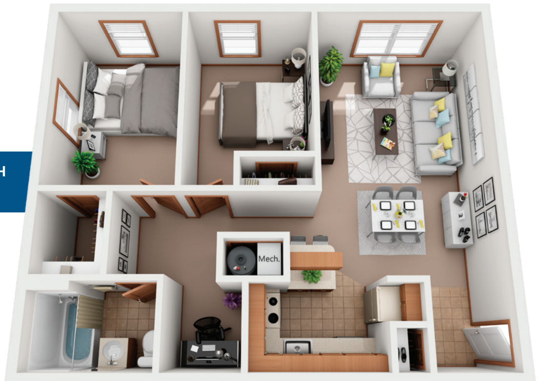
2 BEDROOM/1 BATH 858 SQ. FT.