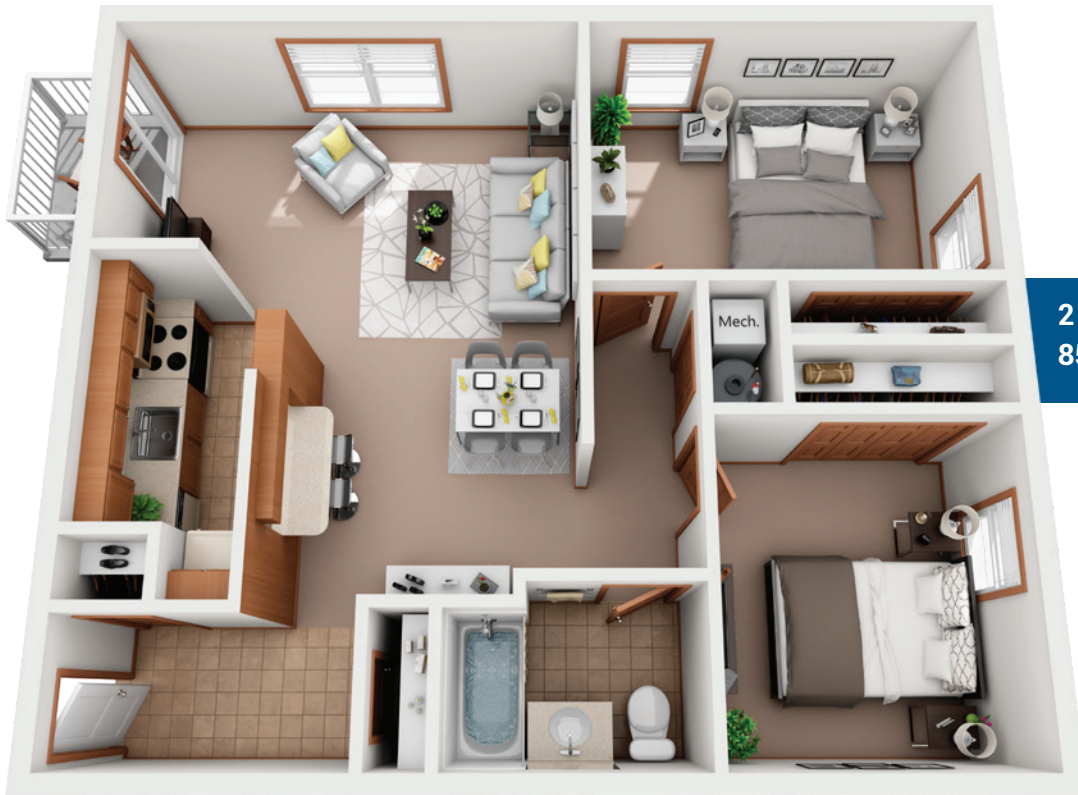
2 BEDROOM/1 BATH 853 SQ. FT.