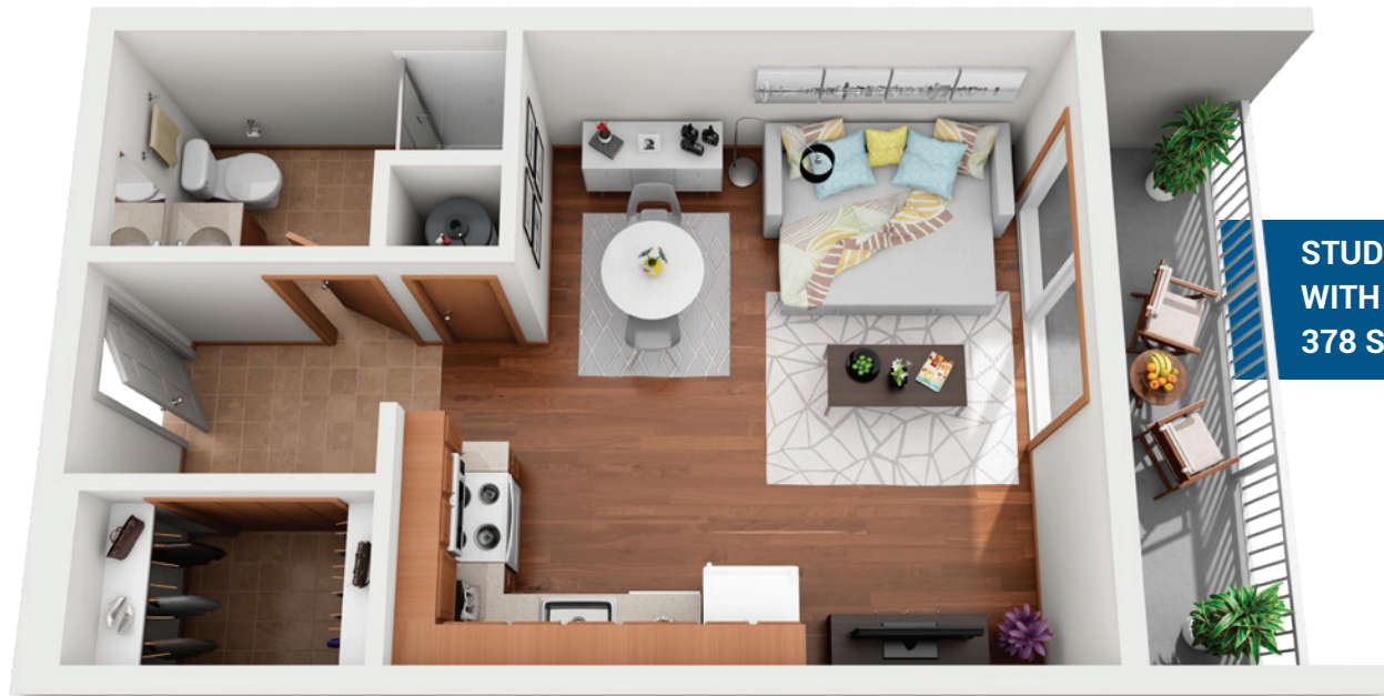
STUDIO WITH SHOWER 378 SQ. FT.