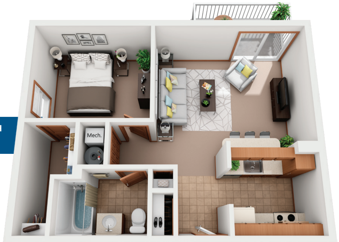
1 BEDROOM/1 BATH 598 SQ. FT.