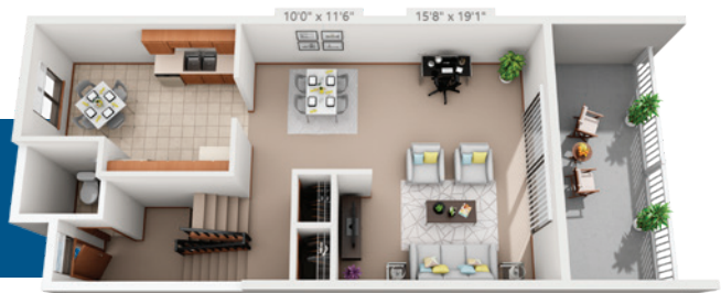
ESSEX 3 BEDROOM/1.5 BATH 1300 SQ. FT.