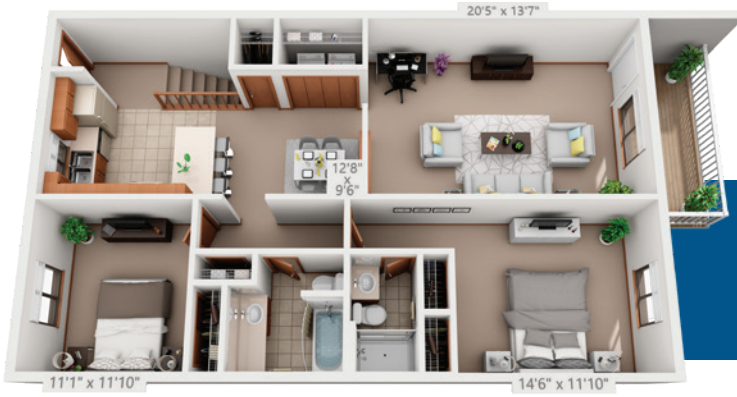
FAIRFAX RANCH 2 BEDROOM/2 BATH WITH FULL BASEMENT 1144 SQ. FT.