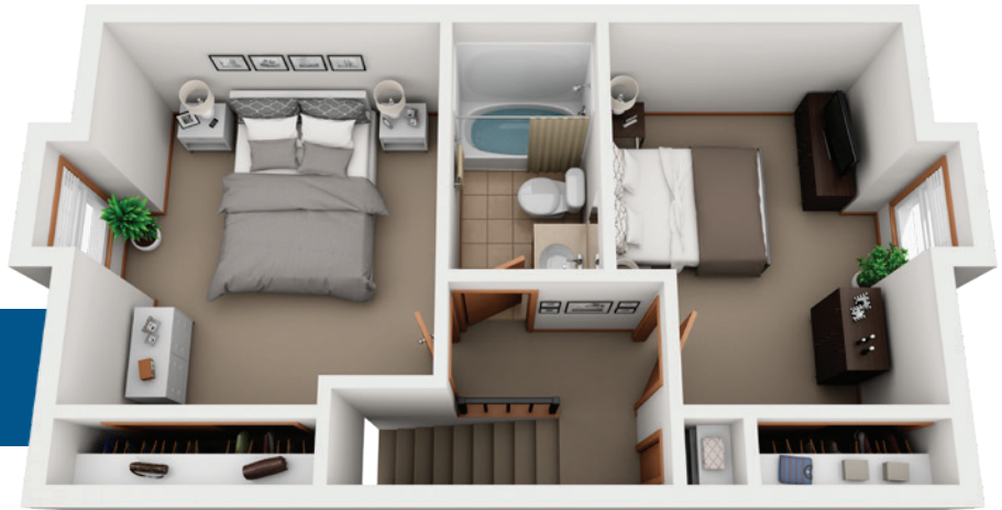
2 BEDROOM/1.5 BATH TOWNHOME 896 SQ. FT.