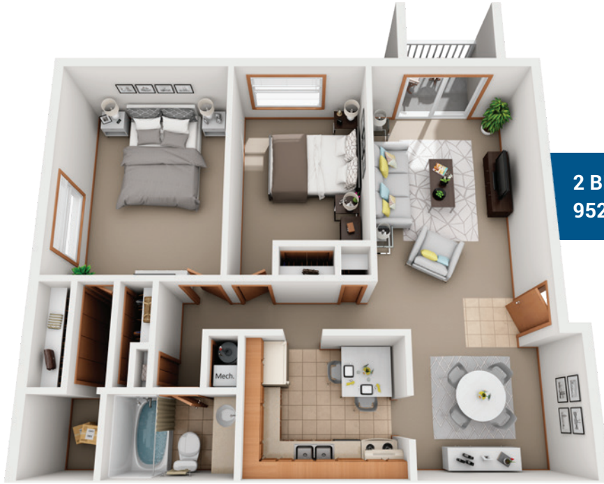
2 BEDROOM/1 BATH 952 SQ. FT.